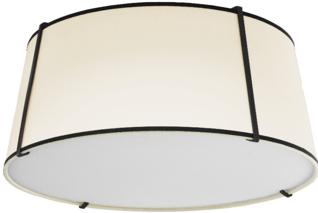
3 Light Trapezoid FlushMount Black/Cream Shade w/ White Fabric Diffuser